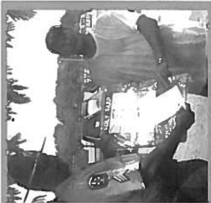
Keep America Beautiful Edgecombe & Nash Counties