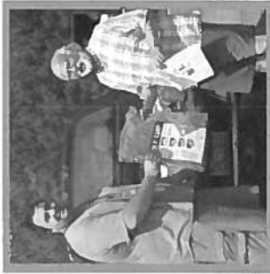
Keep Wake County Beautiful

The Tarp Awareness campaign is administered by Keep North Carolina Beautiful and is executed by 33 Keep America Beautiful affiliates in 31 counties, plus other community partners. The program offers free tarps and educational materials to truck owners at local convenience centers and landfills.