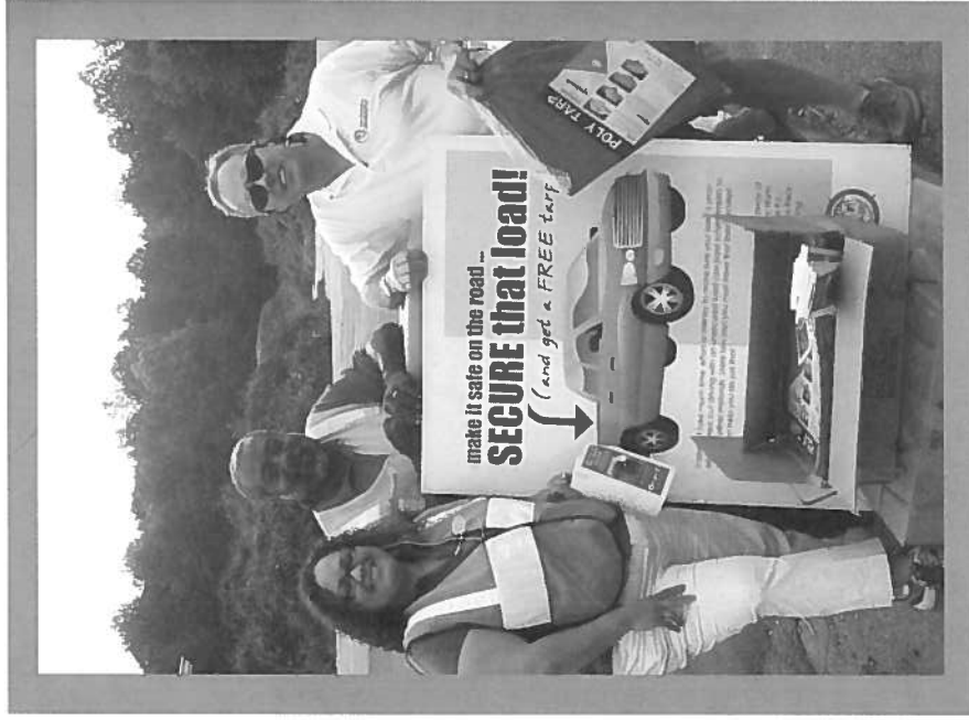
Keep Mecklenburg County Beautiful

North Carolina taxpayers spend millions each year to remove litter that blows out of truck beds. Help save tax dollars, reduce litter and keep our roads safe by using tarps, cargo nets and tie-downs to secure loads.